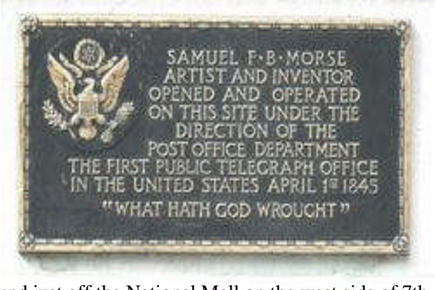
Found just off the National Mall on the west side of 7th Ave, between E and F streets, this plaque commemorates Samuel Morse's groundbreaking achievement.