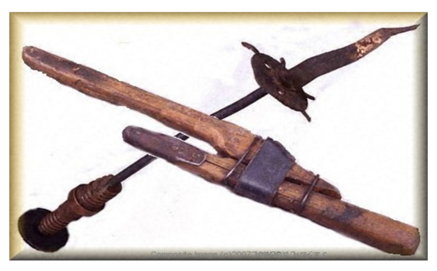
The Wouff-Hong (lower right) and The Rettysnitch (lower left)

So, everyone should check and recheck their own personal operating techniques. We haven't had a good Rettysnitching around here for a long time.