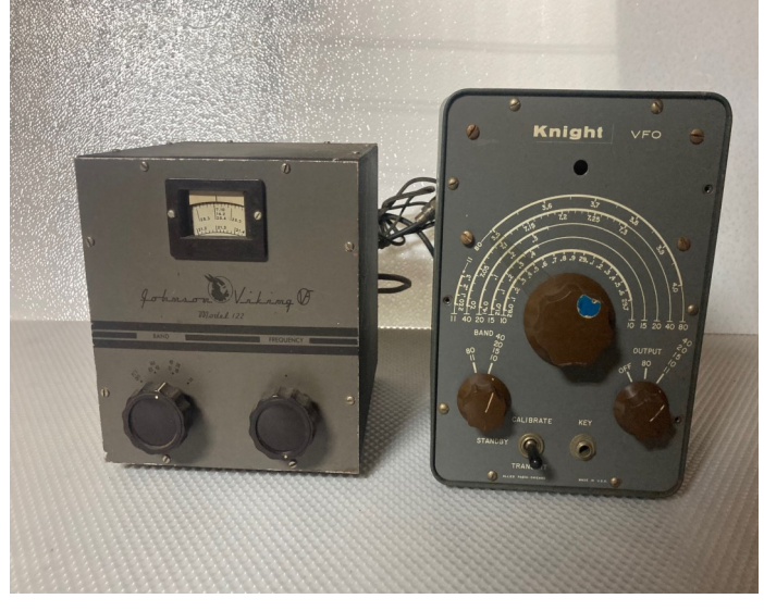
VFOs from Johnson Viking and Knight Kit. Johnson transmitters had great styling.