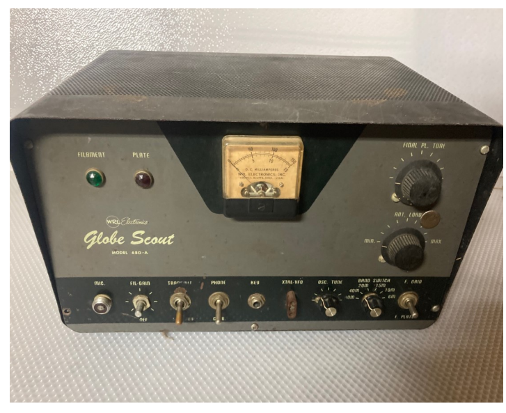
A World Radio Labs 680A was found in many novice hamshacks